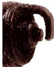
2 - Oily