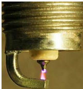
This is how the spark plug works inside the engine

If possible always try to change your spark plug when the engine is cold. This is because metals expand at different rates when heated. The thread on a spark plug is usually made of steel, whereas the cylinder head on your Lambretta is made of an aluminum alloy. If you change your spark plug when the engine is hot, removing it from the soft aluminum cylinder head may cause thread damage to the cylinder head. Also the tightening force you apply when screwing the plug in will change as the engine cools and so you may need to tighten the plug again. Remember to set the gap before putting in the new spark plug, the manufacturer usually sets the gap far too wide, it's a case of gently tapping the end of the plug on a hard surface to reduce the gap, until it is just right, which once again is (0.020 – 0.025” or 0.5 – 0.6 mm) for standard Lambretta Series III engines.