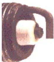
1 - Best